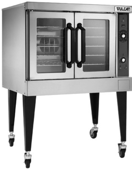
Model VC4ED Shown with optional casters