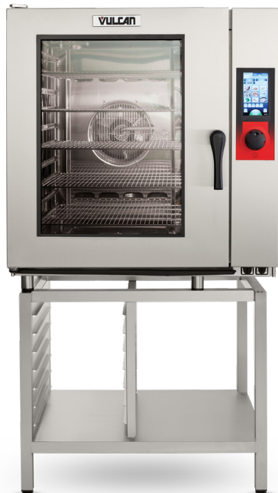
Model TCM101E Shown on optional stand