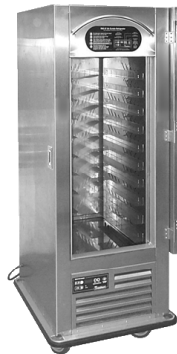
Full Height Door Hinged Right Model