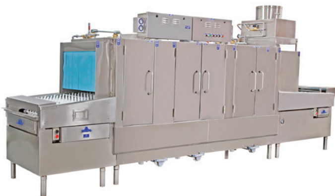
STPCW-ER 3 TANK